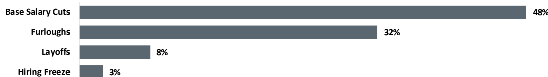
Companies w/CEO base salary cuts also took some type of broad-based action...**

**Only includes companies that disclosed both a CEO base salary cut and broad-based action(s) for its population