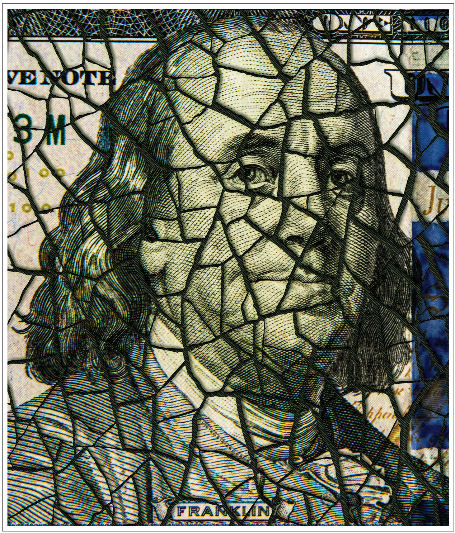
Independents search deep for solutions to mend broken relationships with investors.